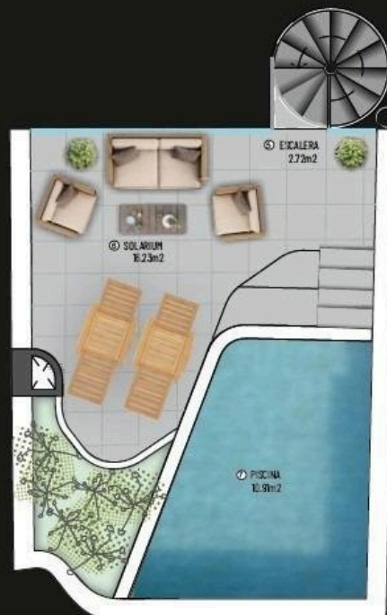
21 PLANTA ÁTICO - 1 DORMITORIO