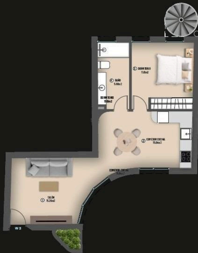
21 PLANTA ÁTICO - 1 DORMITORIO